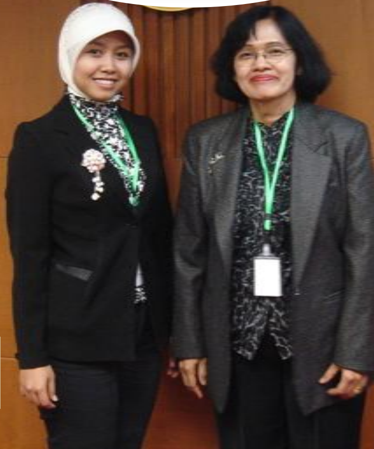
Dyka Santi Int'l Cooperation Staff NCSA-Republic Of Indonesia